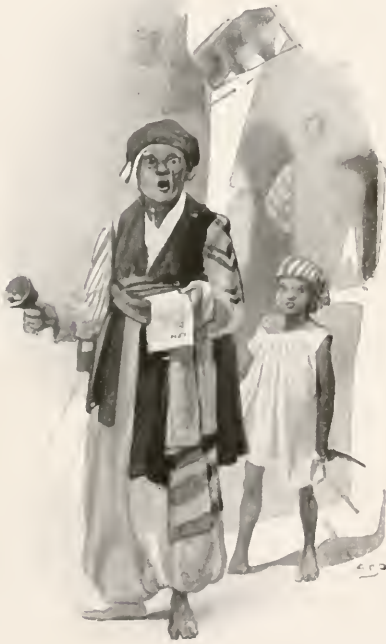
A crier was going through the Bazaar.

When Messour had thanked the Caliph and withdrawn, Harun said: "It is your father, Said, and as I fortunately know the whole truth of the case I will give judgment like Solomon. You shall conceal yourself behind the curtains of my throne until I call you, and you, Grand Vizier, send at once for the wicked and all too hasty police officer. I shall need him as a witness." Both did as they were requested. Said's heart beat quickly when he saw his father's pale and careworn face and noticed the tottering,